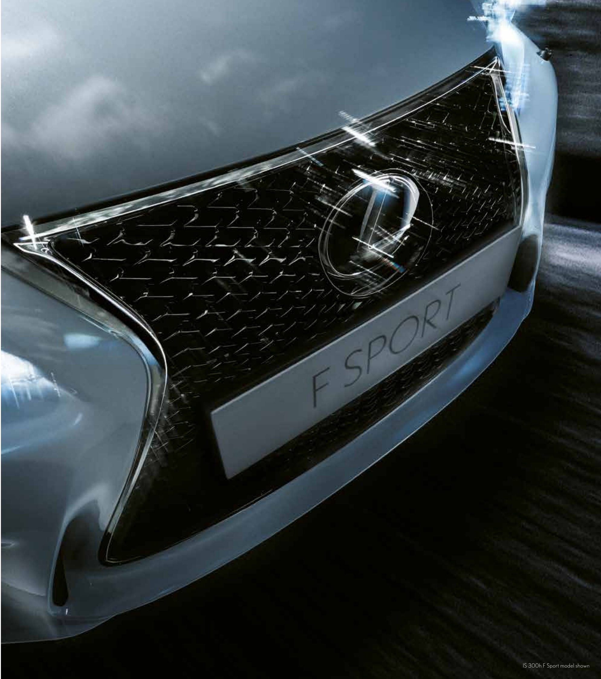
IS 300h F Sport model shown

To learn more about the IS Line contact your Lexus Dealer on 1800 023 009