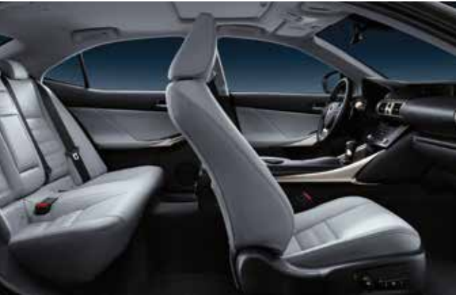
Moonstone Trim Overseas model shown