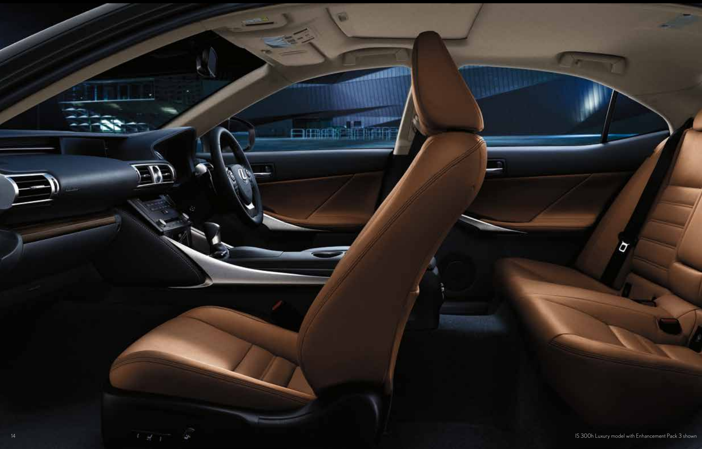
IS 300h Luxury model with Enhancement Pack 3 shown

To quell annoying UV glare, an electric rear sunshade rises up at the touch of a button; a convenience reserved for IS 250 and IS 350 Sports Luxury models, and IS 300h Luxury model with Enhancement Packs 2 and 3. Thoughtfully, the sunshade drops down automatically when you select reverse. F Sport, Sports Luxury and IS 300h Luxury model with Enhancement Packs 2 and 3 are equipped with a self-dimming interior mirror which reduces glare from following motorists.