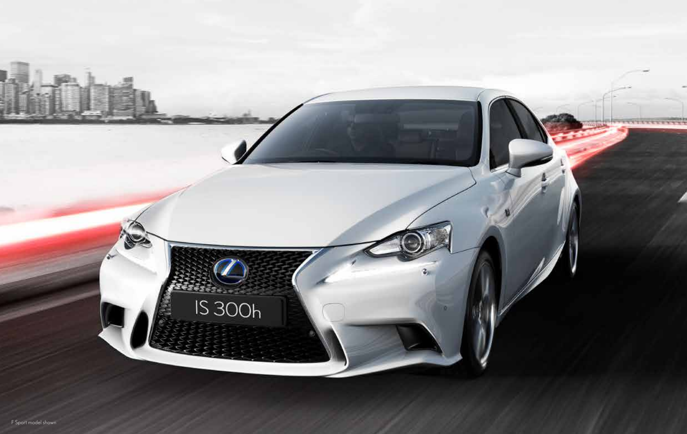
F Sport model shown