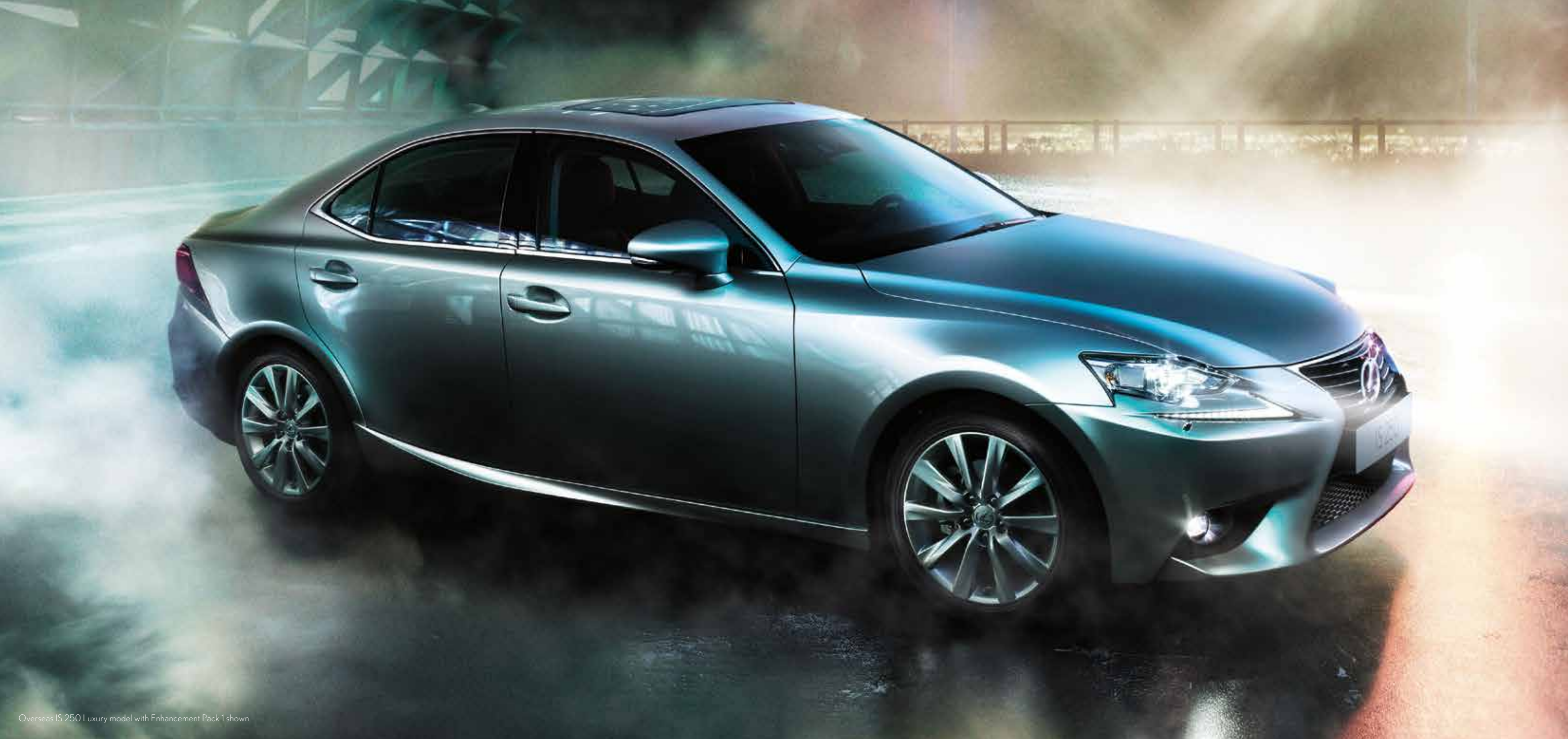
Overseas IS 250 Luxury model with Enhancement Pack 1 shown