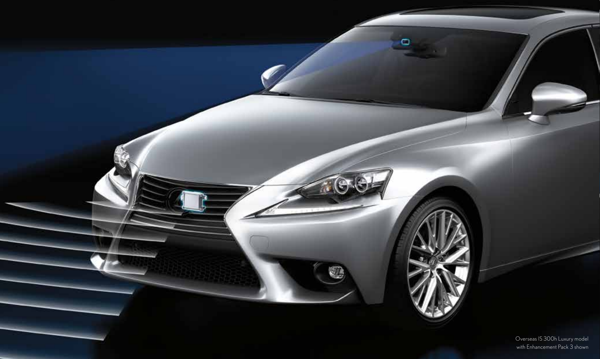
Overseas IS 300h Luxury model with Enhancement Pack 3 shown