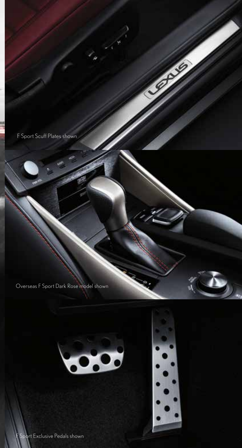
F Sport Scuff Plates shown