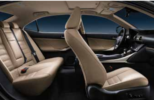
Ivory Trim Overseas model shown

Lexus Australia reserves the right to vary and discontinue the current interior and exterior colours, trims and colour/trim/model combinations. Colours and trims displayed here are a guide only and may vary from actual colours due to printing/display process. See your Lexus dealer to confirm colour/trim/model availability when ordering your vehicle.