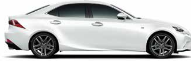
White Nova^ - F Sport only