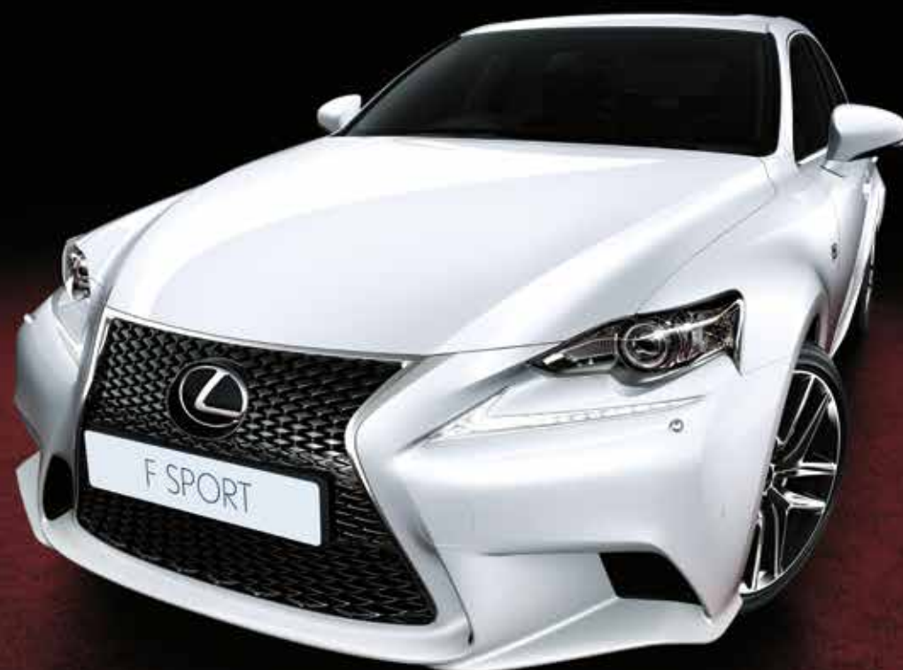
IS 350 F Sport model shown