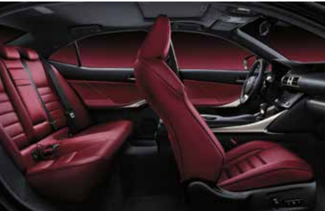
Dark Rose Trim (F Sport models only) Overseas model shown