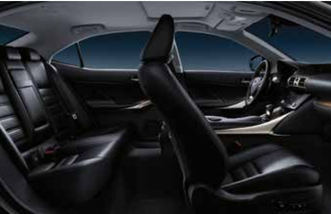
Black Trim Overseas model shown