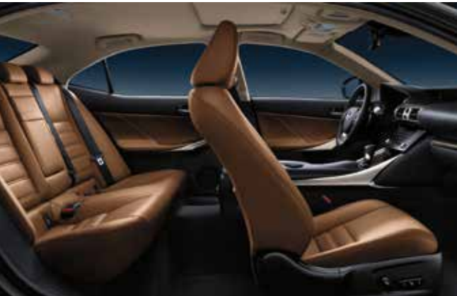
Topaz Brown Trim Overseas model shown