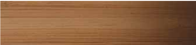
Bamboo (Hybrid models only)