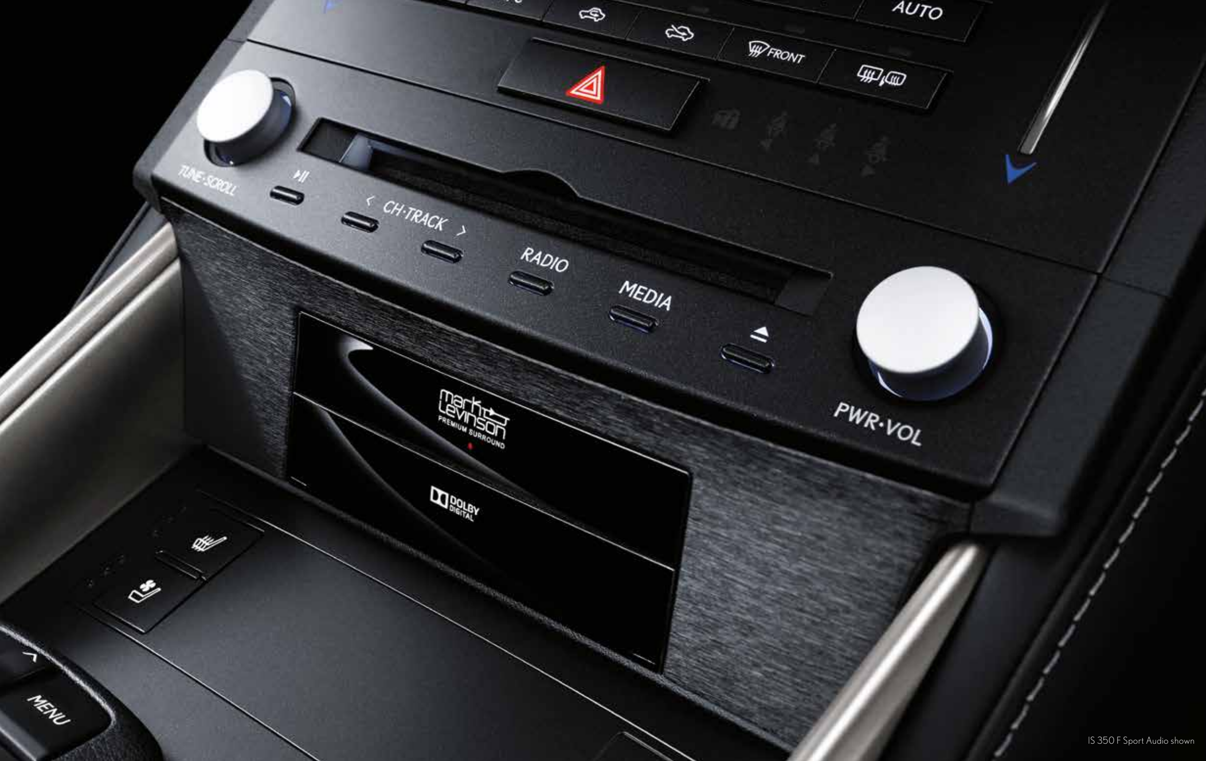
IS 350 F Sport Audio shown