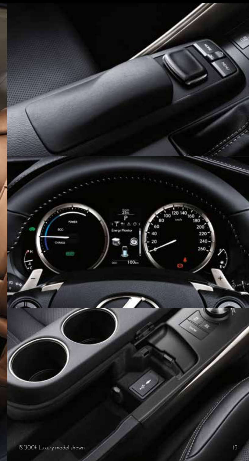
IS 300h Luxury model shown