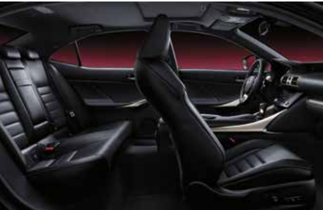
Black Trim (F Sport models only) Overseas model shown